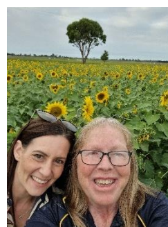
That's a wrap, well done to all the organisers for a great day